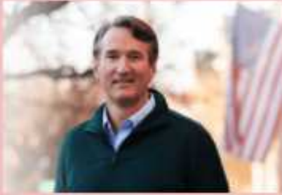
VIRGINIA GLENN YOUNGKIN youngkinforgovernor.com