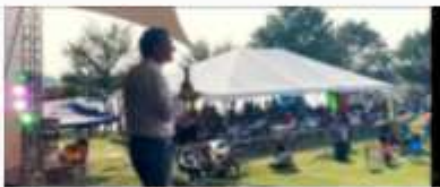
Glenn Youngkin's Day One Game Plan

To learn more about Glenn Youngkin, watch this video: