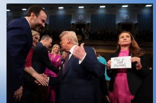
Stephen Colbert slams Dems for 'dressing up in fuchsia' and raising paddles to protest Trump's speech